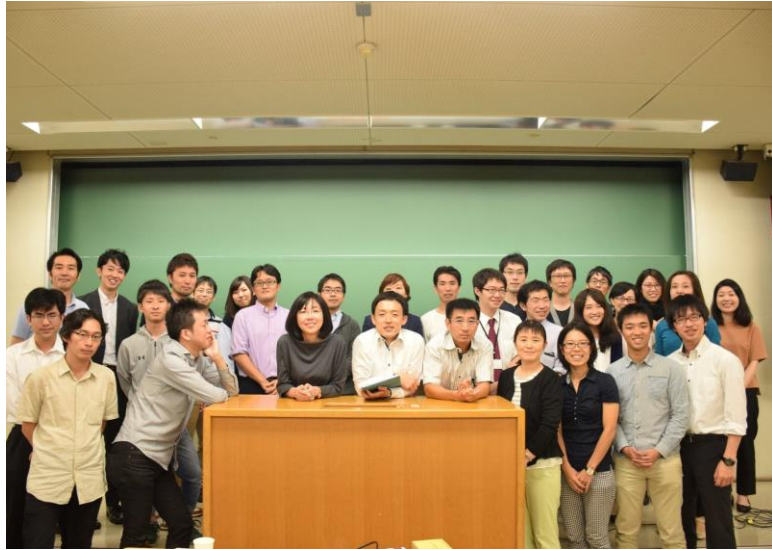
The 1 st JSLARF in 2017 (Tokyo)

An open community where second language researchers and practitioners meet and share our ideas.