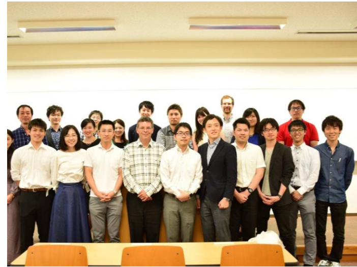
The 2 nd JSLARF in 2018 (Osaka)